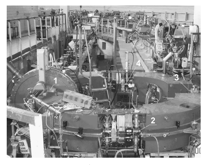
Fig. 1. Booster.

The RF system of the Booster provides the required amplitude of 15 kV of RF voltage in the cavity. For injection into the Booster into one RF separatrix, it is essential that the injected beam should be in a single bunch. That is why the first harmonic of the frequency 34.59 MHz is used.