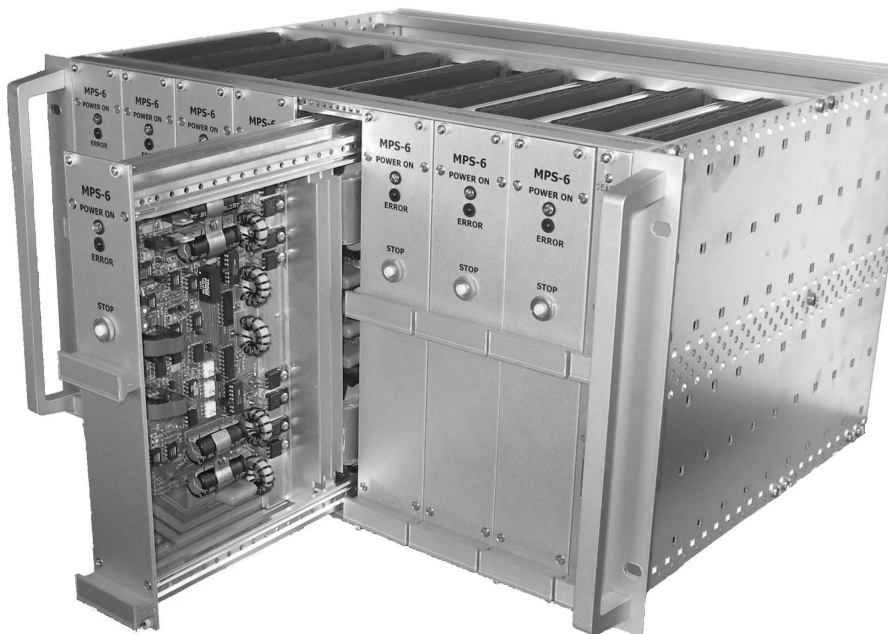
Figure 2: 8-channel module MPS-6

The power supply MPS-25 is monitored and controlled is the same way as the power supply MPS-6 is, via the CAN-bus. In addition to the unit of the controller CEAC124, the MPS-25 power supply allows connecting up to two external signals of binary permission/inhibition commands. The user can turn on the option of remote (from the control computer) switching on/off of the power part of the power supply.